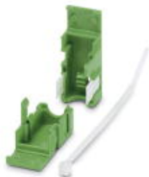
Cable housing, Pitch: 0 mm, Number of positions: 2, Dimension a: 10 mm, Color: green

Please be informed that the data shown in this PDF Document is generated from our Online Catalog. Please find the complete data in the user's documentation. Our General Terms of Use for Downloads are valid ( http://phoenixcontact.com/download )