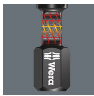
Torsion zone specially designed to absorb such forces and thereby protect the bit tip.