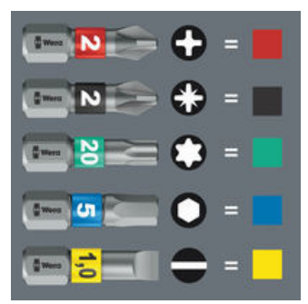
"Take it easy" tool finder with colour coding according to profiles and size stamp – for simple and rapid accessing of the required tool.