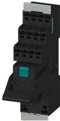
PLUG-IN RELAY COMPACT UNIT 230V AC, 2 CO LED MODULE RED SOCKET W. LOGIC ISOLATION PLUG- IN TERMINAL (PUSH-IN)