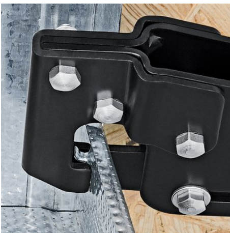
The punching tool is squeezed through the metal section sheets