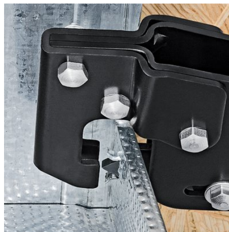
Setting the pliers for connection of two metal section sheets