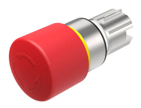
Attention: The preview is based on a sample product. This can differ from your current configuration.