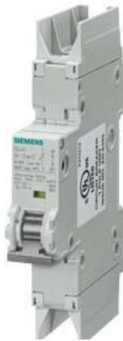
CIRCUIT BREAKER 10KA, 1POLE, C, 15A ACC. TO UL 489 - 277V