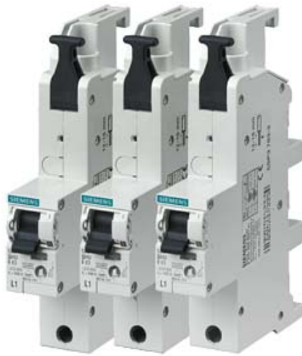
MAIN CONDUCTOR CIRCUIT-BREAKER (SHU), 1-POLE, E 40 A, 230/400 V (SET WITH L1,L2,L3)