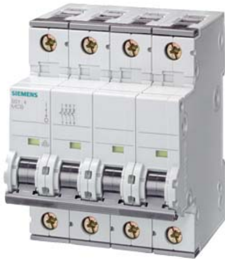
CIRCUIT BREAKER 400V 15KA, 4-POLE, B, 13A, D=70MM