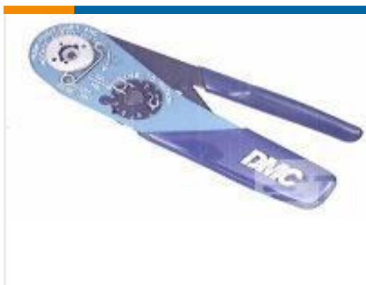
TE Part # 601966-1 CRIMPING TOOL M22520/2-01