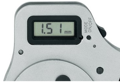
multi-functional digital display, adjustment in mm, inch or comparable selection positions according to MIL