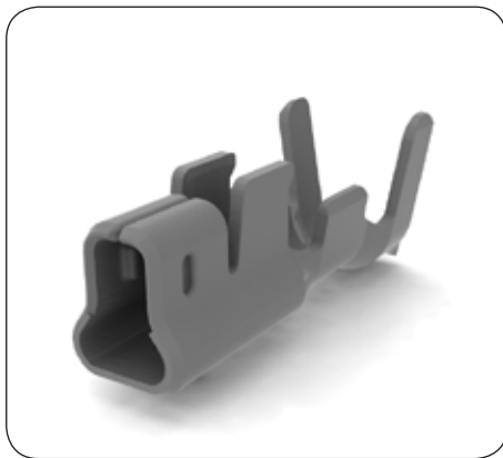
EP 2.5 Phos Bronze Pre-Tin Contact 22-26 AWG, part number 2110989-1