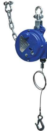
Balancer, EL Model