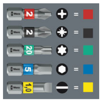
"Take it easy" tool finder with colour coding according to profiles and size stamp – for simple and rapid accessing of the required tool.