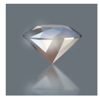
Another product advantage is the coating of the Impaktor bits with minute diamond particles.