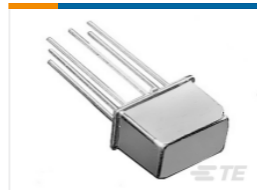
TE Part #1617147-5 JMGAP-26P = M39016/17-030P