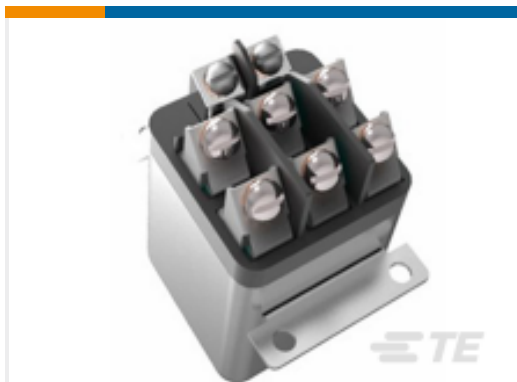
TE Part #1617807-5 FC-335-SY8= RELAY, 3PST