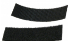
Hook & Loop Mounting Strip 1592ETV