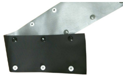
Reversible - Grey on one side and Black on the other