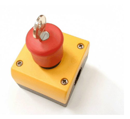
With 1 key

Type: M22-PVS/KC11/IY Article No.: 216523