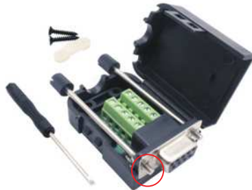
2010C247 - Female connector with locking screw connection