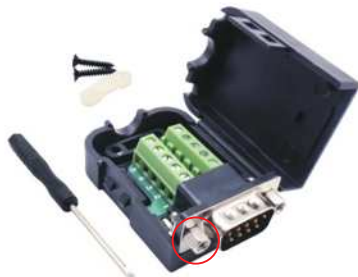
2010C248 - Male connector with jackscrew nut connection