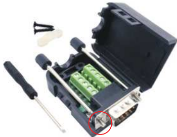
2010C246 - Male connector with locking screw connection