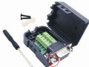
2010C249 - Female connector with jackscrew nut connection

Included accessories 1x Screw driver 1x Cable strain Relief 2x Fastening screw