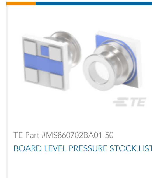
TE Part #MS860702BA01-50 BOARD LEVEL PRESSURE STOCK LIST