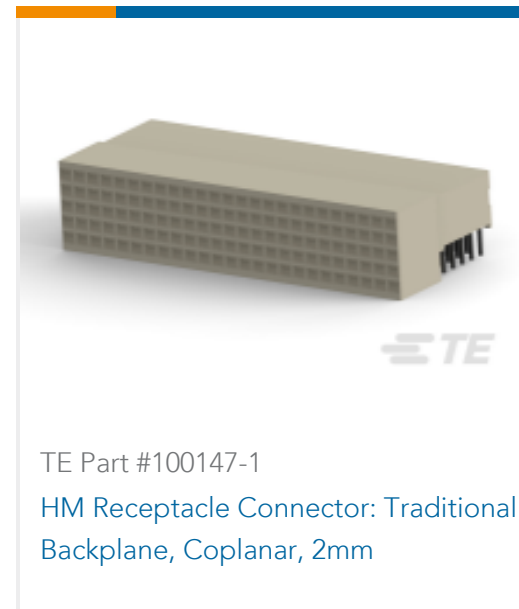
TE Part #100147-1 HM Receptacle Connector: Traditional Backplane, Coplanar, 2mm