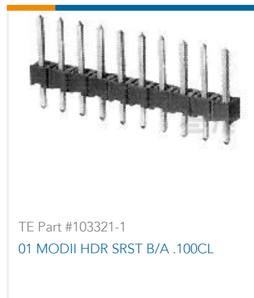
TE Part #103321-1 01 MODII HDR SRST B/A .100CL