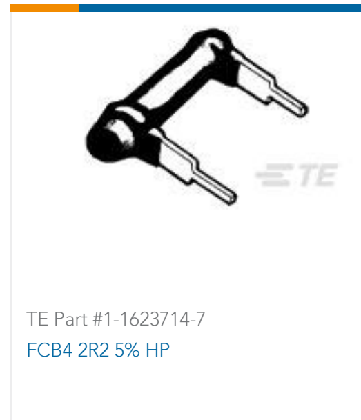
TE Part #1-1623714-7 FCB4 2R2 5% HP