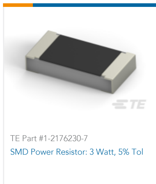
TE Part #1-2176230-7 SMD Power Resistor: 3 Watt, 5% Tol