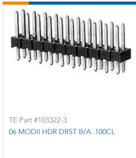
TE Part #103322-3 06 MODII HDR DRST B/A .100CL