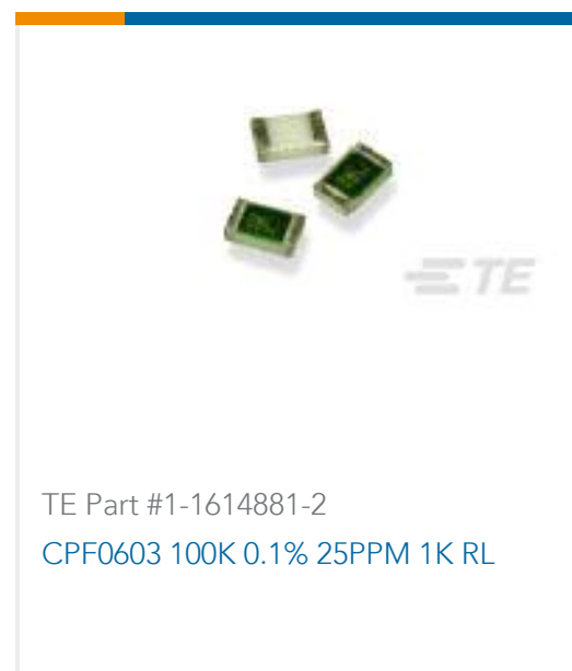
TE Part #1-1614881-2 CPF0603 100K 0.1% 25PPM 1K RL