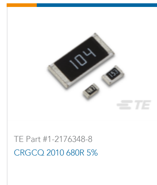
TE Part #1-2176348-8 CRGCO 2010 680R 5%