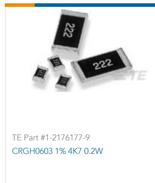
TE Part #1-2176177-9 CRGH0603 1% 4K7 0.2W