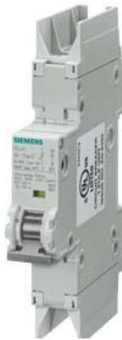
CIRCUIT BREAKER 10KA, 1POLE, D, 0.3A ACC. TO UL 489 - 277V