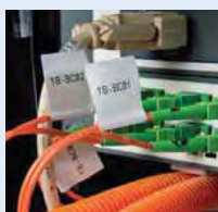
Voice & Data Communications