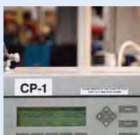
Control Panel and Electrical Panel Labels