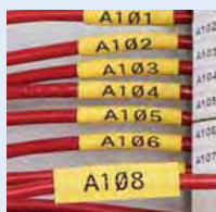
PermaSleeve Wire Marking Sleeves