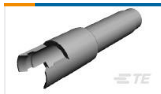
TE Part #1-480401-0 01P CMNL CAP HSG F/H BLK