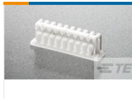
TE Part #1-440146-2 1.25mm WTB Socket,Housing,12p