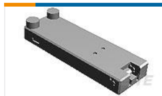
TE Part #1693800-1 CURING FIXT, BULK