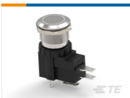
TE Part #1-2364570-9 AVH19 FLT SS MT RNG BLU 24V16A