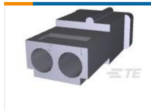
TE Part #1-480393-1 02P CMNL PLUG HSG F/H BLK