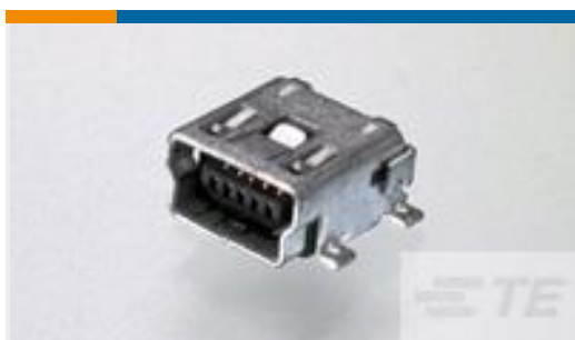
TE Part #1734327-1 MINI USB, TYPE A, R/A, SMT