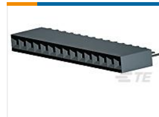
TE Part #1-534237-3 15 MODII VRT SR CE 100/115