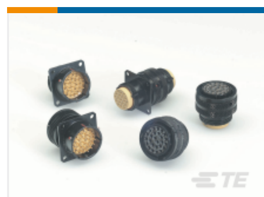
TE Part #ZPF000000000019178 FDPA 56-12-10 SZ-K-A5357