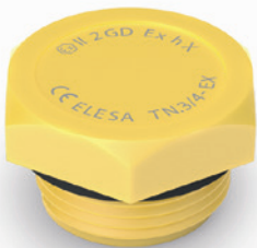
ELESa Original design

The tightening torque recommended in the table prevents accidental loosening of the article, in addition to guaranteeing an optimal seal.