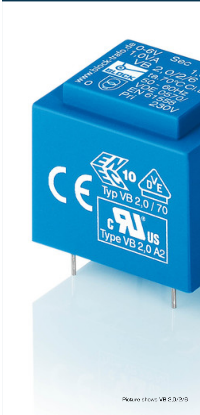
Picture shows VB 2,0/2/6