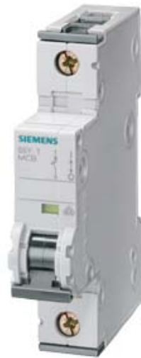
CIRCUIT BREAKER 230/400V 15KA, 1-POLE, D, 20A, D=70MM