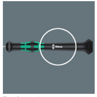
The fast-turning zone just below the rotating cap allows rapid twisting.