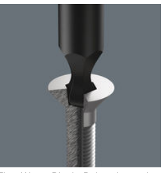
The Wera Black Point tip and a refined hardening process ensure long service life of the tip, improved corrosion protection and an exact fit.