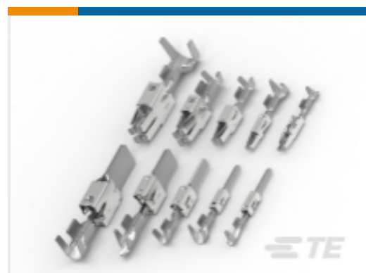
TE Part #969042-1 TIMER, RECEPTACLE AND TAB