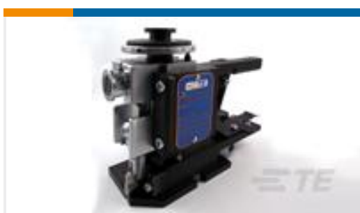
TE Part #2150234-1 OCEAN_2.0_APPLICATOR-E-110F180F