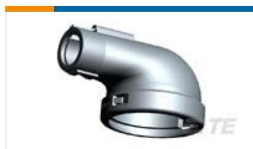
TE Part #1-1718284-2 ADAPTER 90°FOR 10-14POS. SOCKE