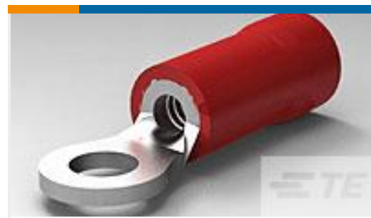
TE Part # 34141 PG R 22-16 COMM 22-18 MIL 4