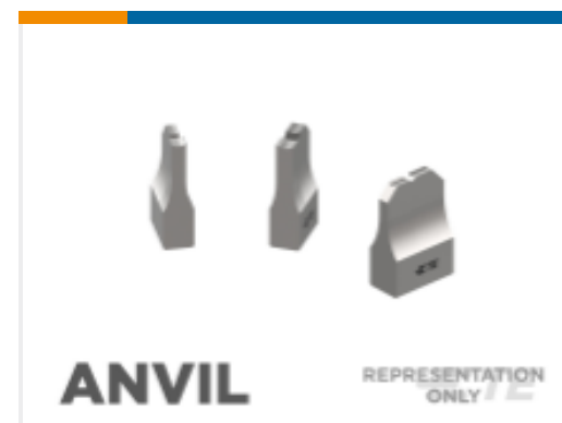
ANVIL REPRESENTATION ONLY TE Part #1-1633919-6 ANVIL COMBINATION