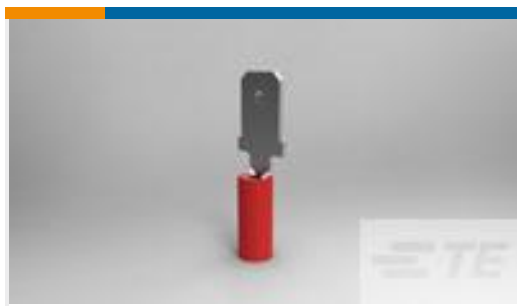
TE Part # 66023-2 TAB,PIDG TERMI-BK 22-16