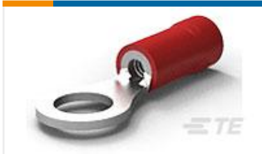
TE Part # 34149 PG R 22-16 COMM 22-18 MIL 10