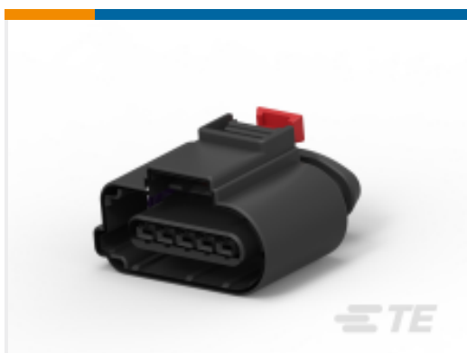
TE Part #2-968977-9 AMP MCP, SEALED CONNECTOR HOUSING