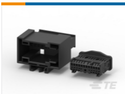
TE Part #144935-1 MQS, CONNECTOR HOUSING