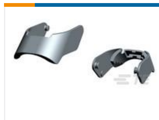
TE Part #1-1355133-2 HEBEL F.AUFNAHM-GEH