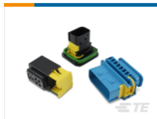
TE Part #1-1564534-1 HEAVY DUTY SEALED CONNECTOR HOUSINGS