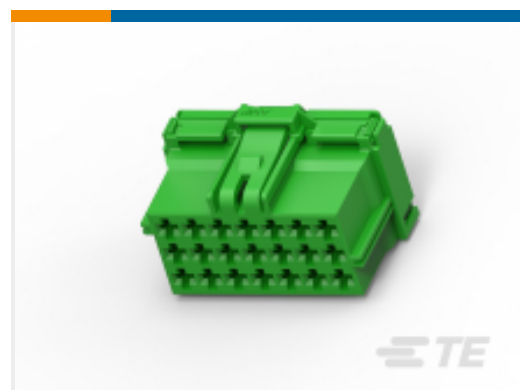
TE Part #2-968976-9 AMP MCP, UNSEALED CONNECTOR HOUSING