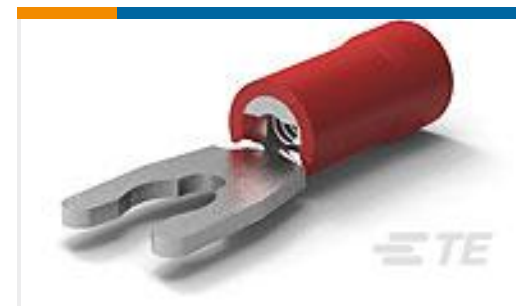
TE Part # 53240-1 PG SP SPD 22-16COMM22-18MIL 6