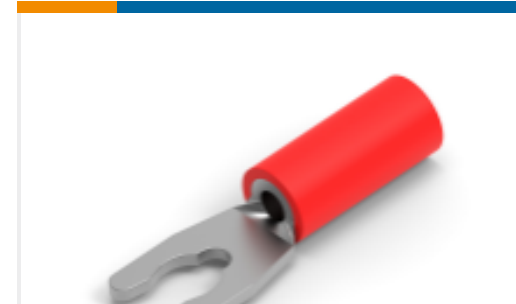
TE Part # 52949 PG SPR SPD 22-16COMM 22-18MIL6