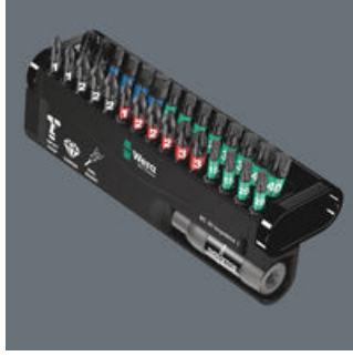
The Bit-Checks can be positioned upright at the workplace so the tool is always quickly to hand.