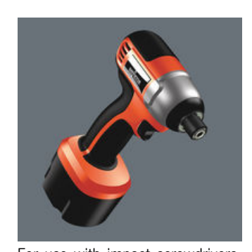
For use with impact screwdrivers. Improve productivity when screwdriving with power tools.