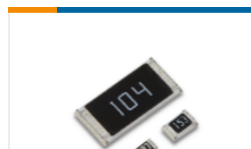
TE Model / Part #4- 2176337-0 CRGCQ 0402 18K 1%