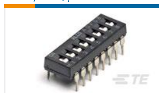
TE Model / Part #2- 1825059-9 ADF06ST04=DIP SWT, FLUSH,SMT-GW