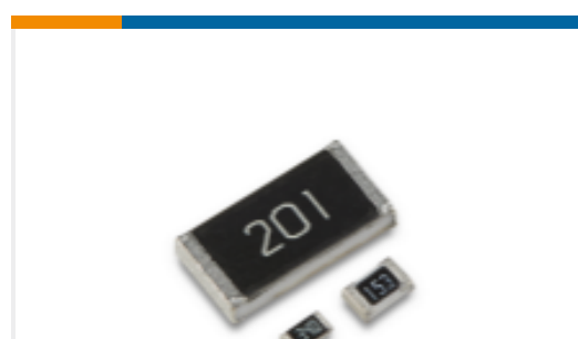
TE Model / Part #1- 2176325-3 CRGP 0402 100R 1%