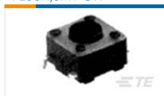
TE Model / Part #1571563-2 FSM4JSMLXTR=TACT, SMT,T&R