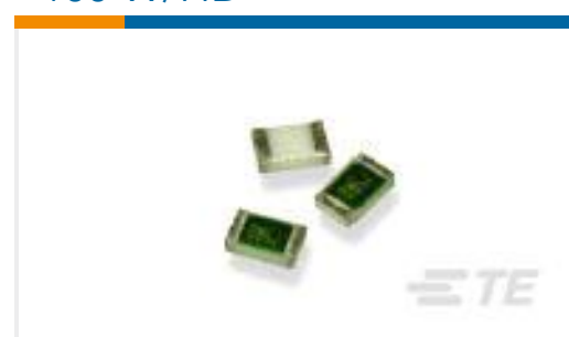
TE Model / Part #1879417-1 CPF0603 510K 0.1% 25PPM 5K RL