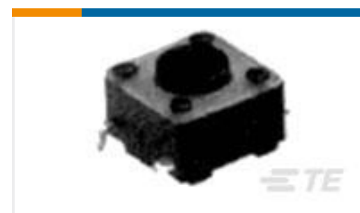
TE Model / Part #1977223-4 FSM2JSMASTR=6MM TACT SWITCH, SMT 160gf, 100 W/HD