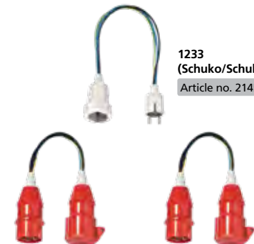
1233 (Schuko/Schuko) Article no. 2145900