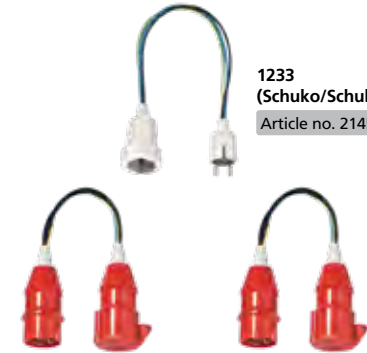
1233 (Schuko/Schuko) Article no. 2145900