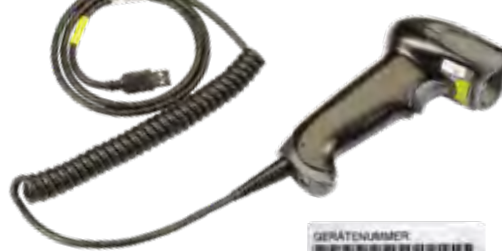
Barcode scanner BC-1250G