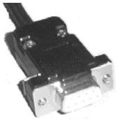
AS-i Master in IP65 (Specification 2.0)