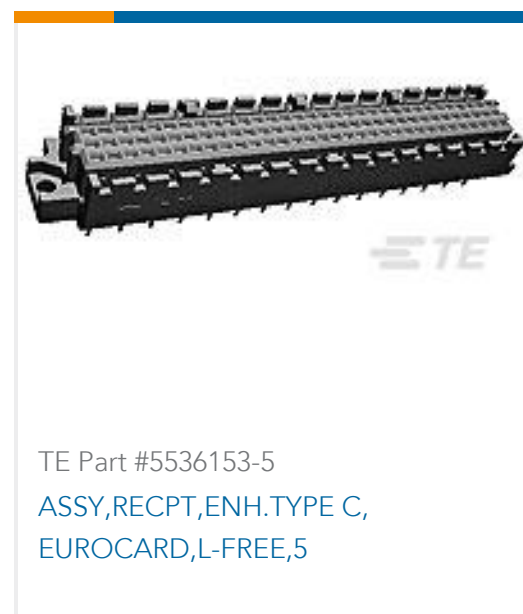
TE Part #5536153-5 ASSY, RECPT, ENH. TYPE C, EUROCARD, L-FREE, 5