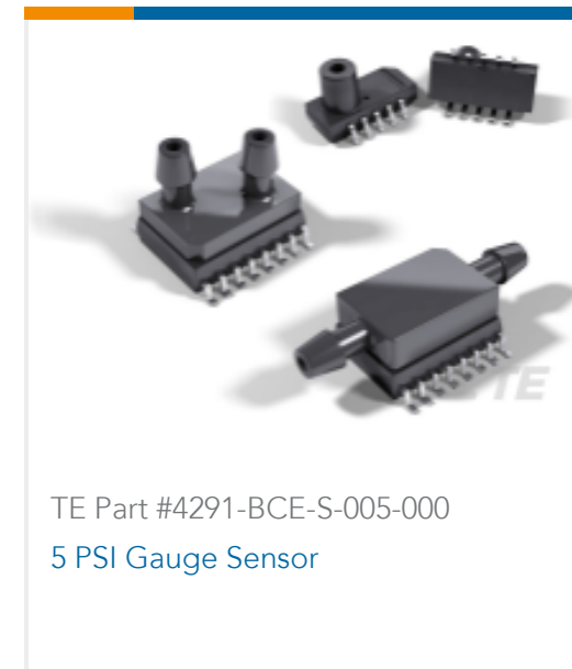
TE Part #4291-BCE-S-005-000 5 PSI Gauge Sensor