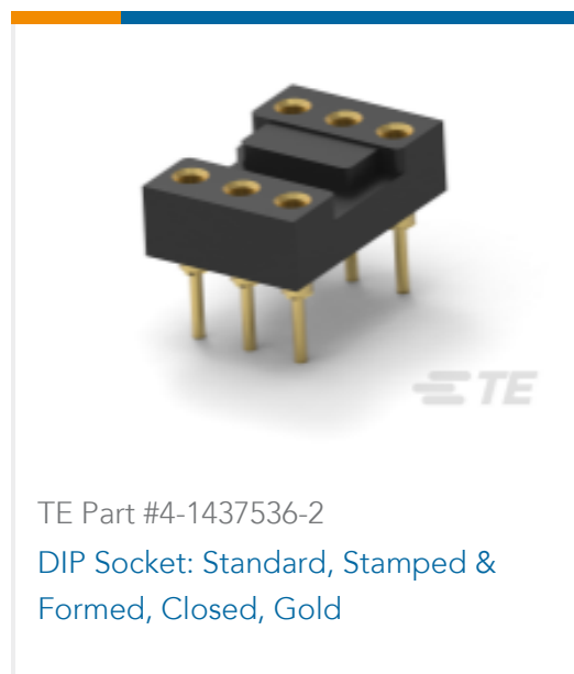
TE Part #4-1437536-2 DIP Socket: Standard, Stamped & Formed, Closed, Gold