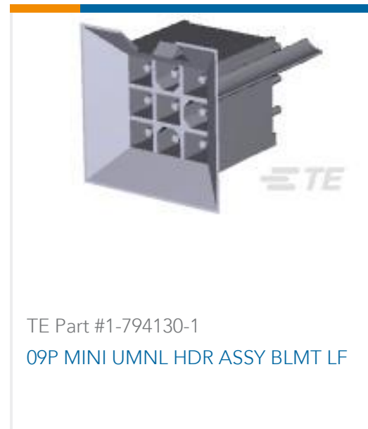
TE Part #1-794130-1 09P MINI UMNL HDR ASSY BLMT LF