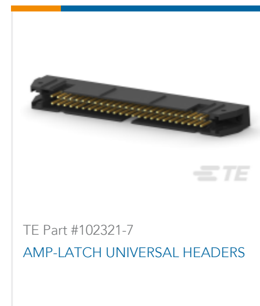
TE Part #102321-7 AMP-LATCH UNIVERSAL HEADERS