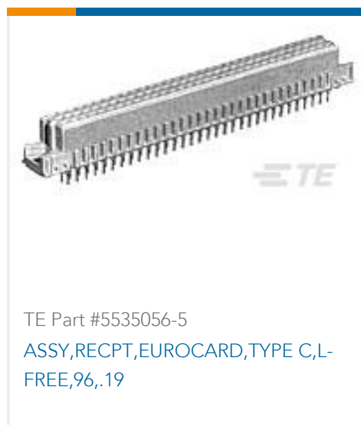
TE Part #5535056-5 ASSY, RECPT, EUROCARD, TYPE C, L-FREE, 96, 19