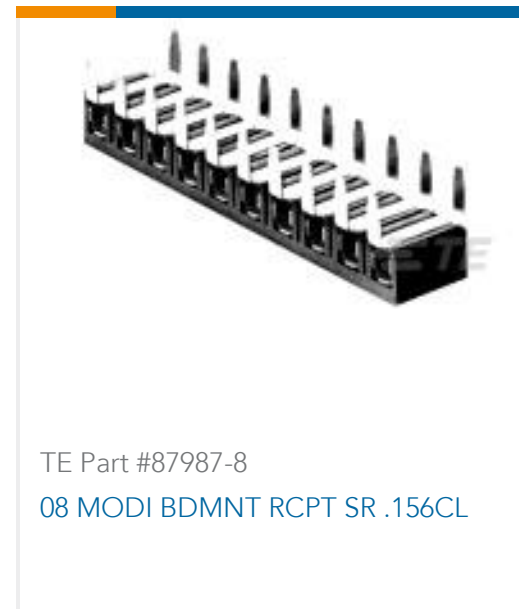
TE Part #87987-8 08 MODI BDMNT RCPT SR .156CL