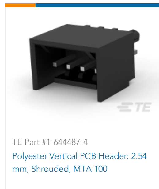
TE Part #1-644487-4 Polyester Vertical PCB Header: 2.54 mm, Shrouded, MTA 100