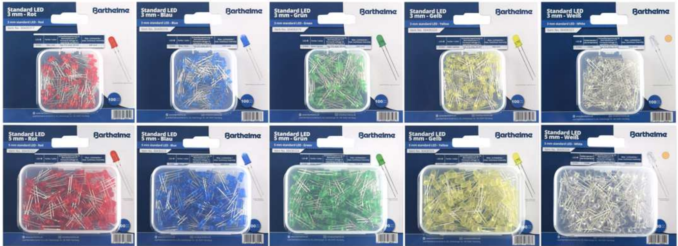
ø 3 mm LED Diode