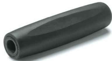
ERGOSTYLE® ELESA Original design