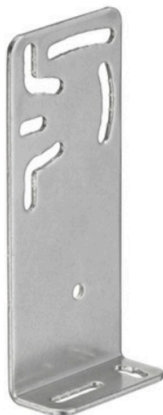
Part no.: 50118542 BT 200M.5 Mounting bracket