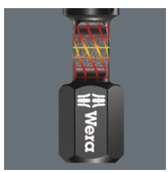
Torsion zone specially designed to absorb such forces and thereby protect the bit tip.