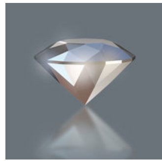
Another product advantage is the coating of the Impaktor bits with minute diamond particles.