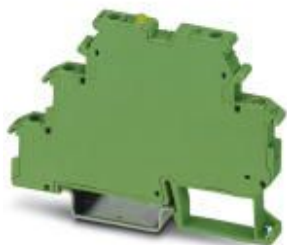
Power solid-state relay terminal block, input: 24 V DC, output: 3 - 30 V DC/3 A, terminal block width: 6.2 mm

Please be informed that the data shown in this PDF Document is generated from our Online Catalog. Please find the complete data in the user's documentation. Our General Terms of Use for Downloads are valid ( http://phoenixcontact.com/download )