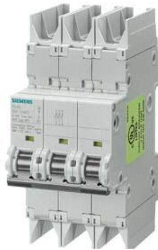
CIRCUIT BREAKER 10KA, 3POLE, C, 4A ACC. TO UL 489 - 480Y/277V