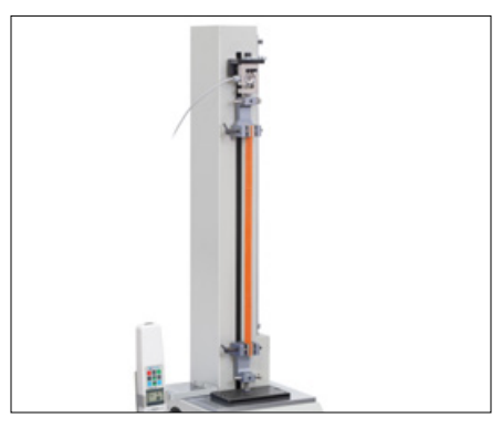
A wide range of application possibilities because of its large travelling distance