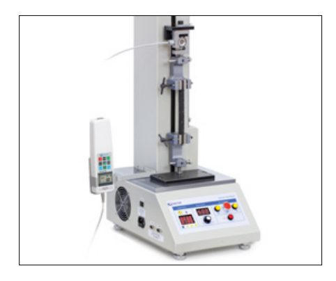
Solid and flexible fixing options for many terminals and accessories from the SAUTER product range, see accessories