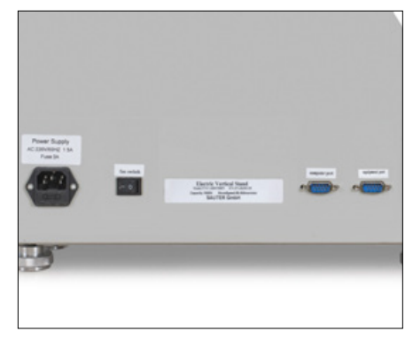
Interface for data transmission from the SAUTER FH measuring device and for controlling the test stand with SAUTER AFH software