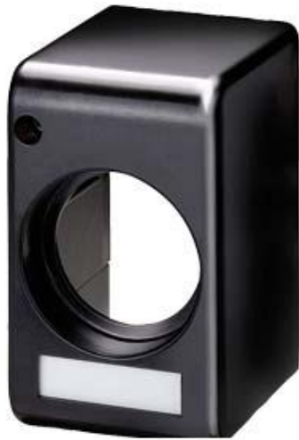
DIAZED MOULDED-PLASTIC CAP SIZE DIII/63A, THREAD E33