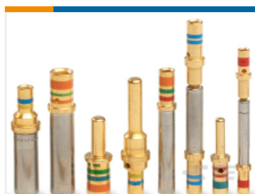
TE Part #ZPF0000000000000416 006-1157-12 A