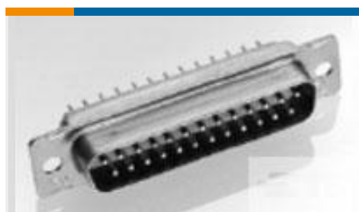
TE Part #1-1757824-2 AMPLIMITE,ASY,RCPT,STD,90,ZN,6, CONT