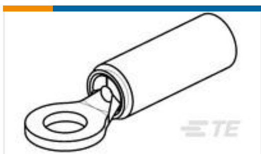
TE Part #1577626-1 TERMINAL RT PIDG PEEK STRATO 20 AWG