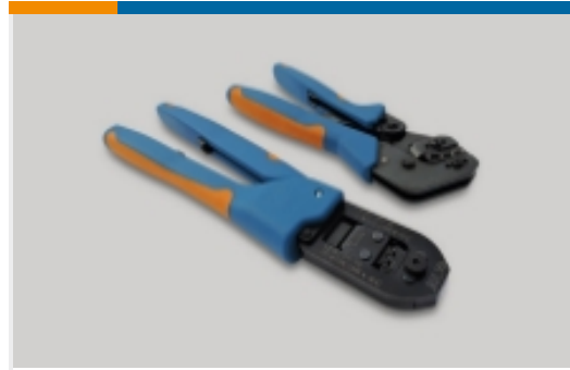
Portable Crimp Tools(2)