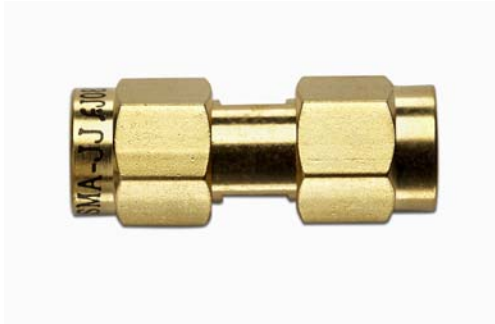
Model 72964 SMA PLUG (M) / PLUG (M)

High bandwidth, small size, and durability for confident connections.