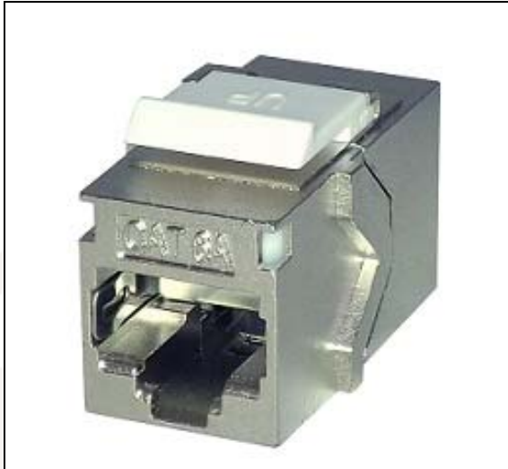
Category 6A Shielded Keystone Panel Mount Coupler (SGACK2S, SGACK2S-24)