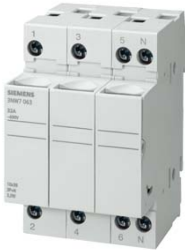
BUILT-IN FUSE BASE FOR CYLINDRICAL FUSES SIZE 10X38MM 32A, 3POLE+N