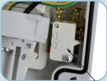
Micro-switch for switch status indication

- Possibility of positioning two micro-switches: both for the switch status indication (open/closed) and to indicate the presence of the plug (present/missing).