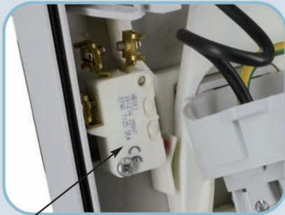
Micro-switch for plug insertion status