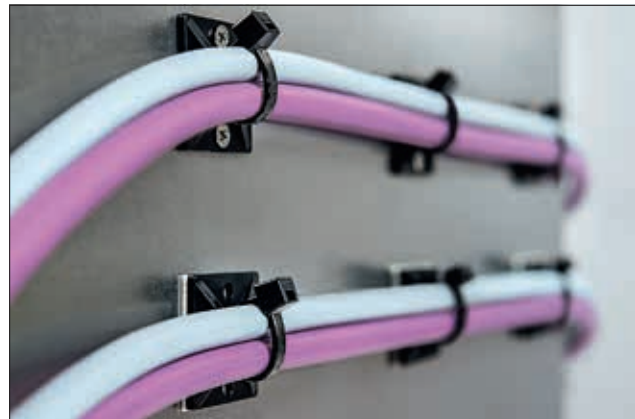
MB-Series Mounts with square design / screwable, self adhesive.