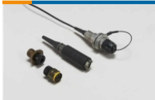
Expanded Beam Fiber Optics(9)