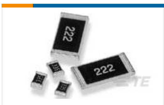
TE Part #8-1879501-3 CRGH2512 5% 2K7 2W