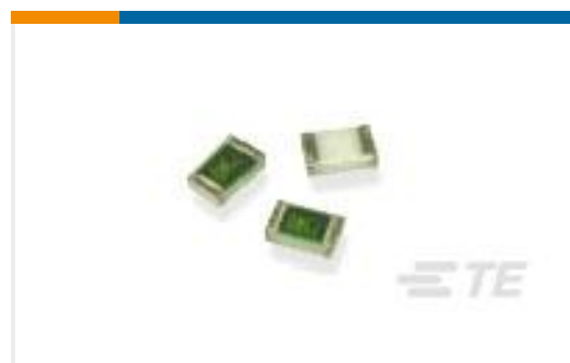
TE Part #1676272-2 RN 0805 26K7 0.1% 10PPM 1KRL