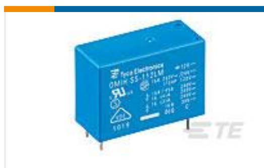
TE Part #3-1440000-8 OMI-SH-112D,394