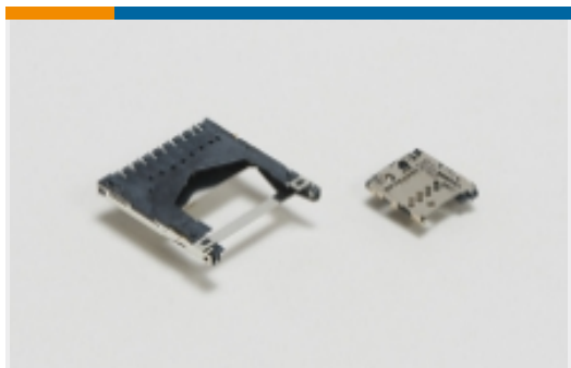
SD Card Connectors(1)