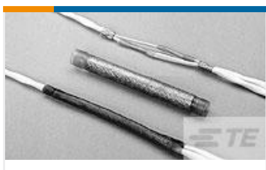
TE Part #766146-000 D-150-0170