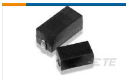
TE Part #4-1676966-1 SMW2 4R7 5%