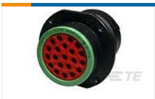
TE Part #HDP24-18-21PN REC, 21P, BLK, N, 20, P