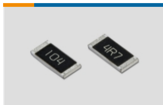
Surface Mount Resistors(545)