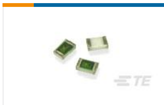
TE Part #1676346-2 RN 0805 464R 0.1% 10PPM 1KRL