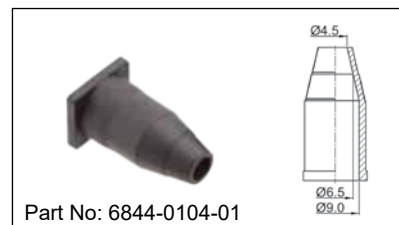
Part No: 6844-0104-01