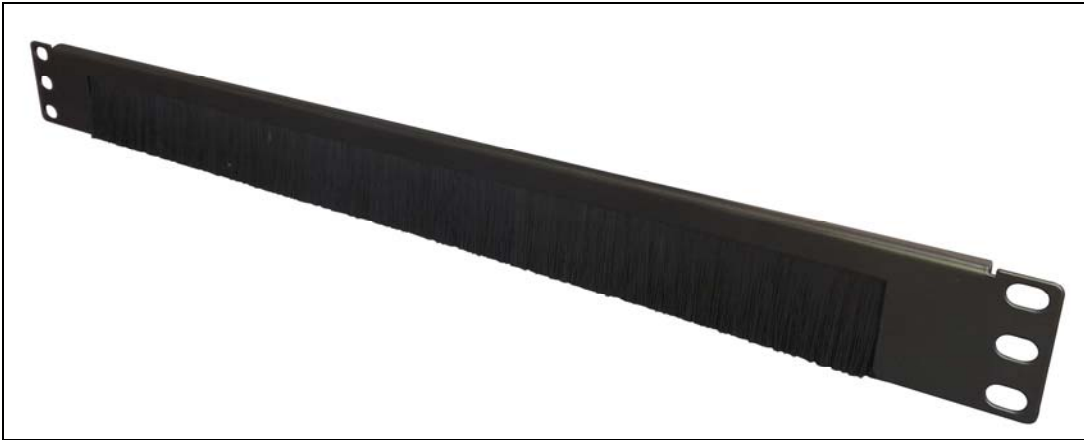
1U Open Brush Strip Panel (MBrushBK)

The brush strip panels enable the installer to organise the cabinet while minimising disruption of airflow. Unlike letterbox-style brush panels, our single sided panels offer the advantage that one item can be used for both a small or (by using 2 pieces, one inverted) a large opening.