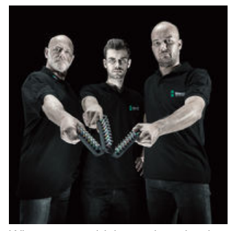
Whoever would have thought that the storage of sockets could be completely revolutionised and that someone could come up with a stylish belt with securely attached sockets that can still be easily removed.